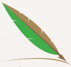
Nehme Kourani Middle School Principal